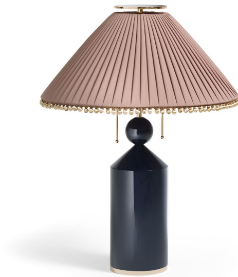
Table lamp for diffused or downward lighting. Wood base dark blue lacquered, metal elements polished gold. Dark blue lampshade, internal and structure black, with ribbon trim. Light source: 2XE27.