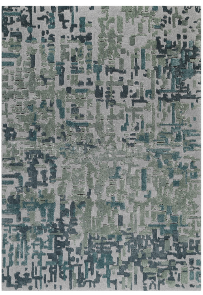
'Crossover' in Acqua Green and Lagoon Blue